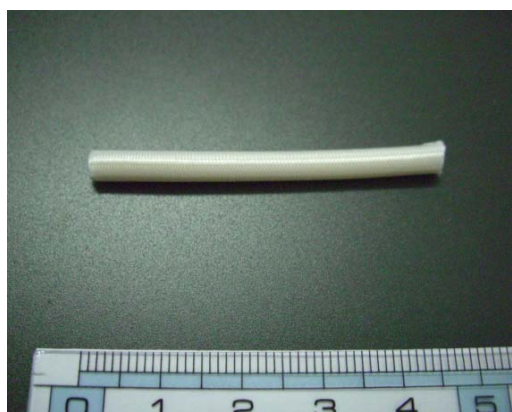
Outside view of a Nerbridge™ conduit

Toyobo is aiming for sales of Nerbridge™ of ¥5.0 billion annually by 2015.