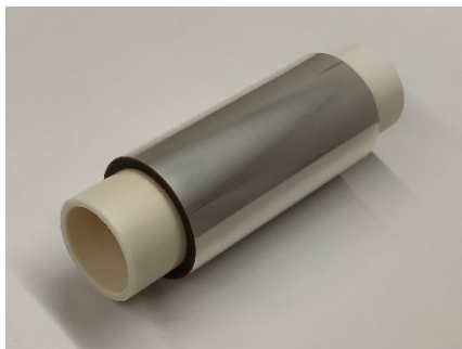
Newly developed PEF film

Toyobo Co., Ltd. has developed the industry's first* 1 biaxially oriented polyethylene furanoate (PEF) film made from 100% plant-derived materials and will begin providing samples in June. Although PEF films are entirely plant-derived, they offer 60% higher rigidity* 2 and ten times better oxygen gas barrier properties* 3 than petroleum-derived polyethylene terephthalate (PET) films. These properties enable PEF films to enhance the reliability and functional performance of industrial components, including those used in electronic devices.