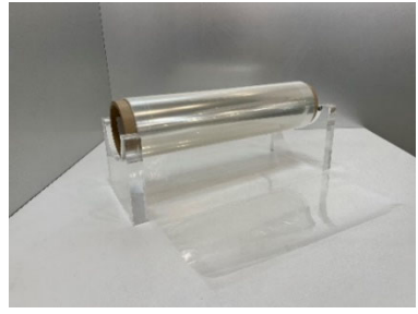
A roll of highly heat-resistant adhesive sheet

Vitrimers are a new class of cross-linked resins, which possess dynamic covalent bonds with associative bond exchange mechanism. The new product was developed by taking advantage of vitrimers' property to respond to pressure and heat — just like thermoplastic resins — while maintaining the cross-linked state of polymers. Toyobo MC Corporation plans to start providing samples, manufacturing and selling the product to electronic material makers soon.