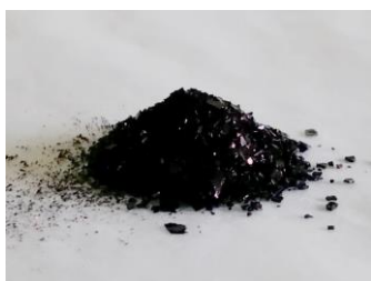
Power-generating material for OPV

Toyobo recently launched a joint research effort with CEA, which was enthusiastic about the high output performance of indoor OPV modules using the new material as well as the usability of the production process. In collaboration with CEA, Toyobo will strive to develop the technology needed for practical OPV using Toyobo's material with an eye to the European market, which is expected to be among the first to embrace OPV.