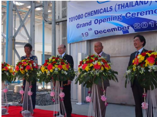
Opening ceremony for the new plant

Principal applications include adhesives, coating materials, metal can coating, wire coatings, film surface modifiers, and conductive silver paste.