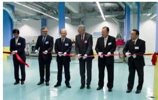
Opening ceremony for the Obernburg Plant