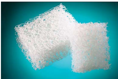
「BREATHAIR ® 」

TOYOBO Europe is working to expand sales of the BREATHAIR ® business in the European market, where environmental awareness is high. Sales activities are beginning with the development of furniture applications and proceeding to mattresses for medical use, seats for boats, automobiles, and railcars, and other uses.