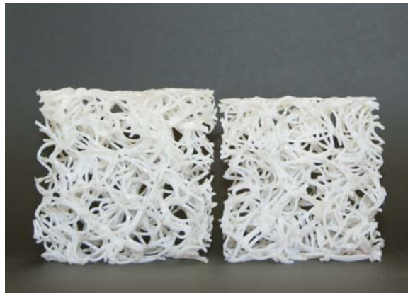
(Before testing) (After testing)