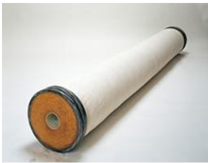
Hollow fiber forward osmosis (FO) membrane

Toyobo Co., Ltd. has jointly developed an environmentally friendly water treatment system equipped with a hollow fiber forward osmosis (FO) membrane for desalination plants. The company worked with SWPC (Sustainable Water Power Consultants FZ LLC) headquartered in Abu Dhabi, UAE, a consultant company in the field of seawater desalination, and Arabian Japanese Membrane Company, LLC (AJMC), a consolidated subsidiary of Toyobo, to develop the system, having filed a provisional patent application with the United States Patent and Trademark Office. We will continue to conduct demonstration tests to achieve the system's early commercialization.