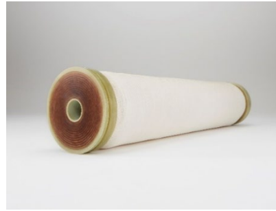
Water Treatment Membranes