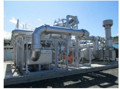
Environmental Solution Devices